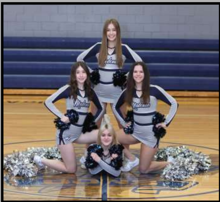
2023 Competition Cheer Squad