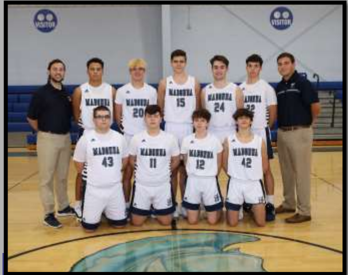
2022-23 JV Boys Basketball Team