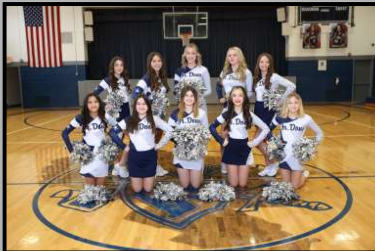
2022-2023 Winter Cheer Squad