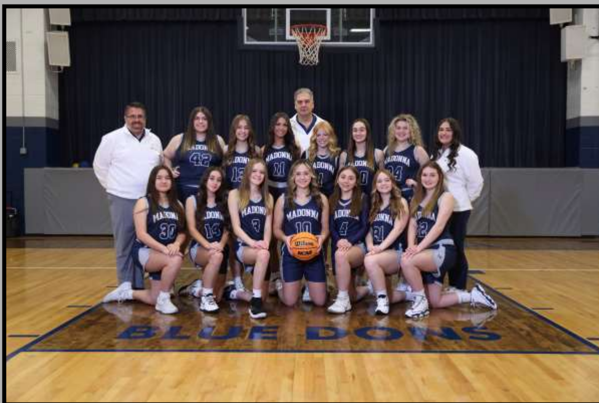
2022-23 Girls Basketball Team