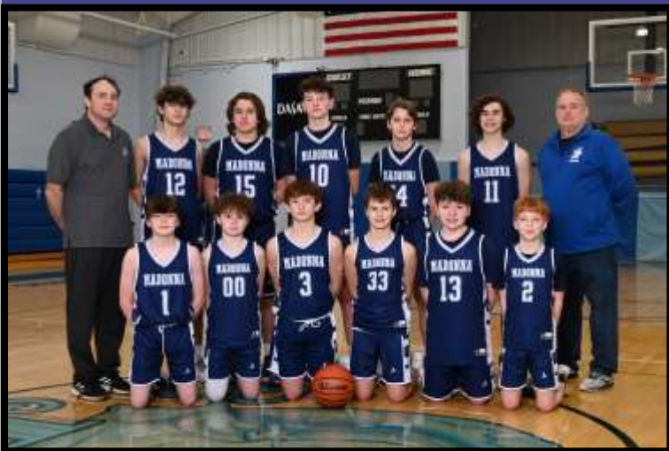
2022-2023 Boys Basketball Team