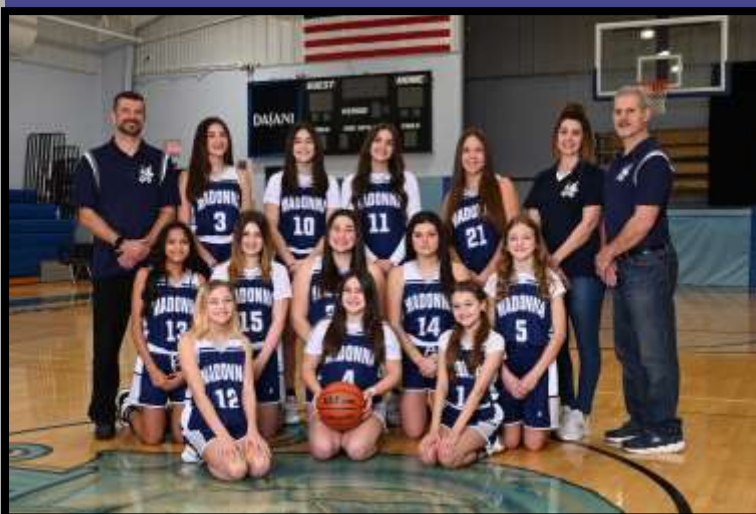
2022-2023 Girls Basketball Team