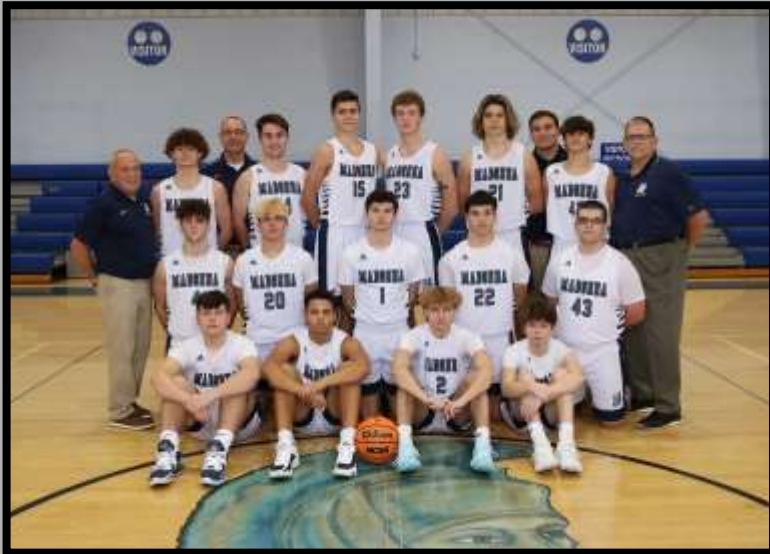
2022-23 Varsity Boys Basketball Team