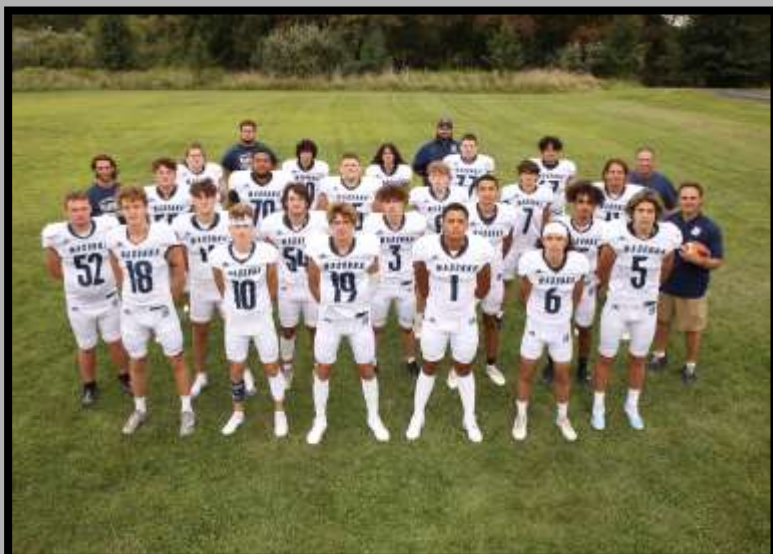
2022 Football Team