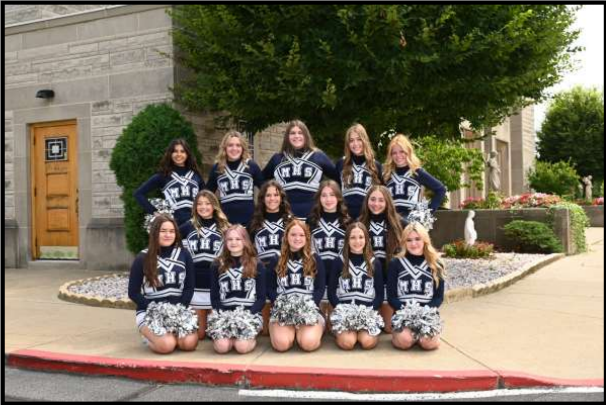
2022 Cheerleading Squad