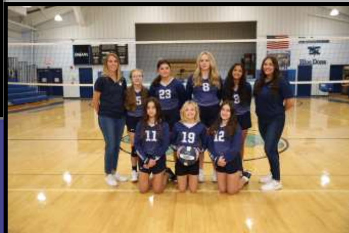
Right: 2022 7th Grade Volleyball Team