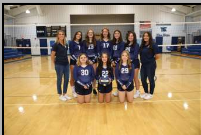
Above: 2022 8th Grade Volleyball Team