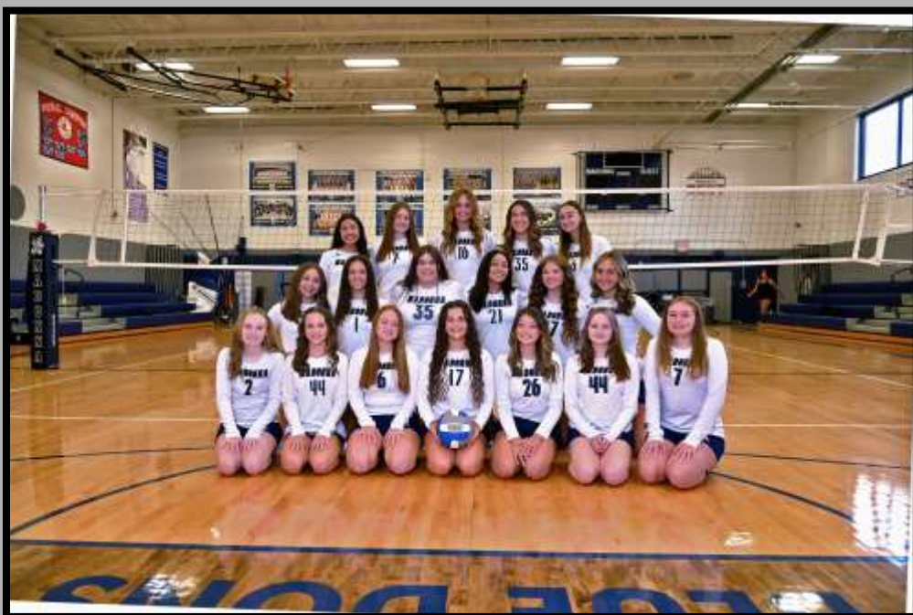
2022 Volleyball Team