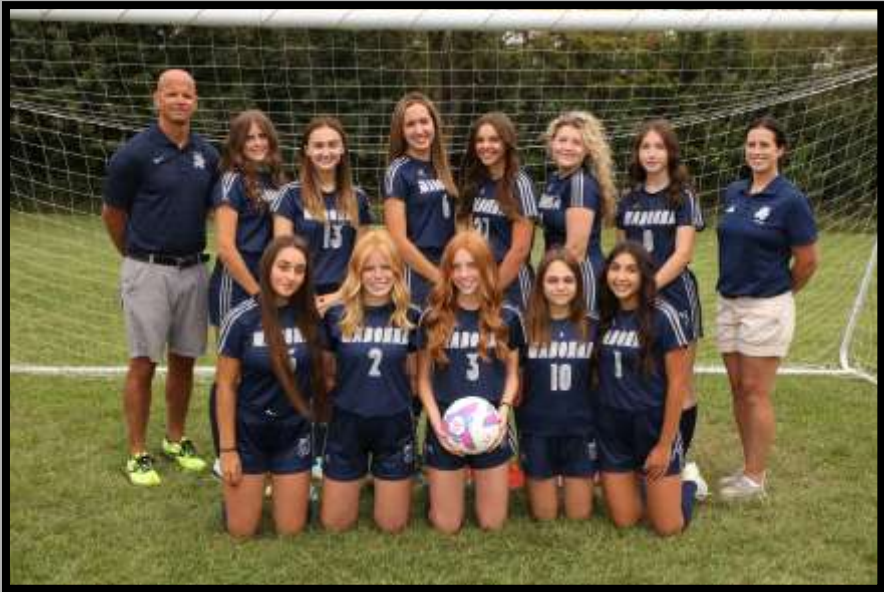
2022 Girls Soccer Team