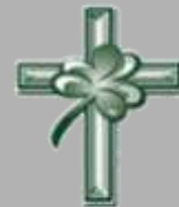
St. Paul School

Cub Scout Pack 151 organized a Veteran's Day breakfast. The Scouts welcomed 100 guests into the school to honor veterans.