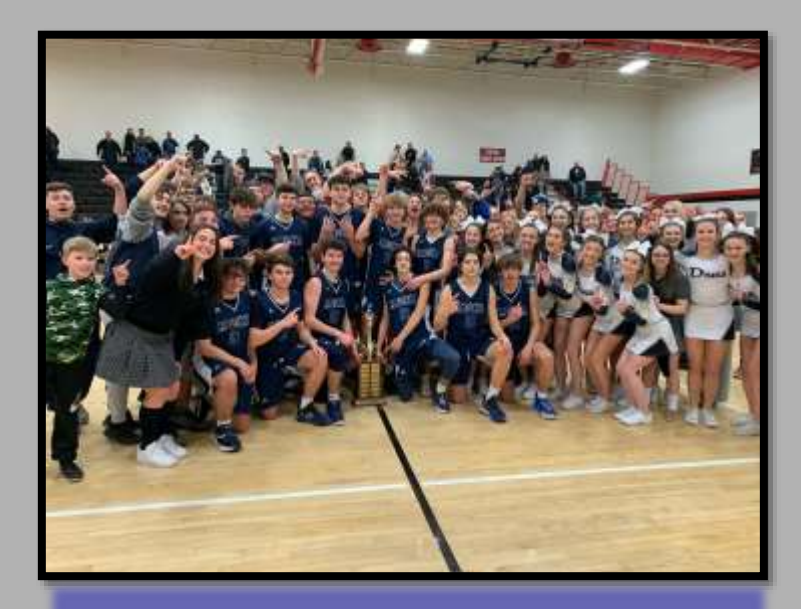
Boys' Basketball beat Weir in OT to with the 2022 City Championship!

The boys get a send off for their trip to States!