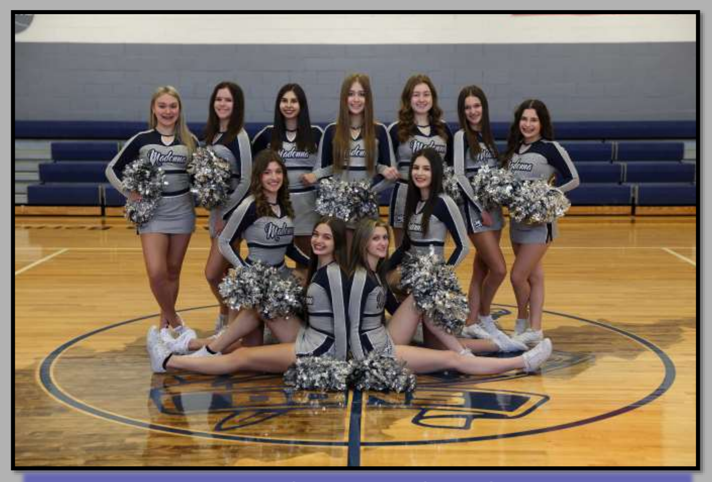
2021 Winter Competition Cheer Squad.