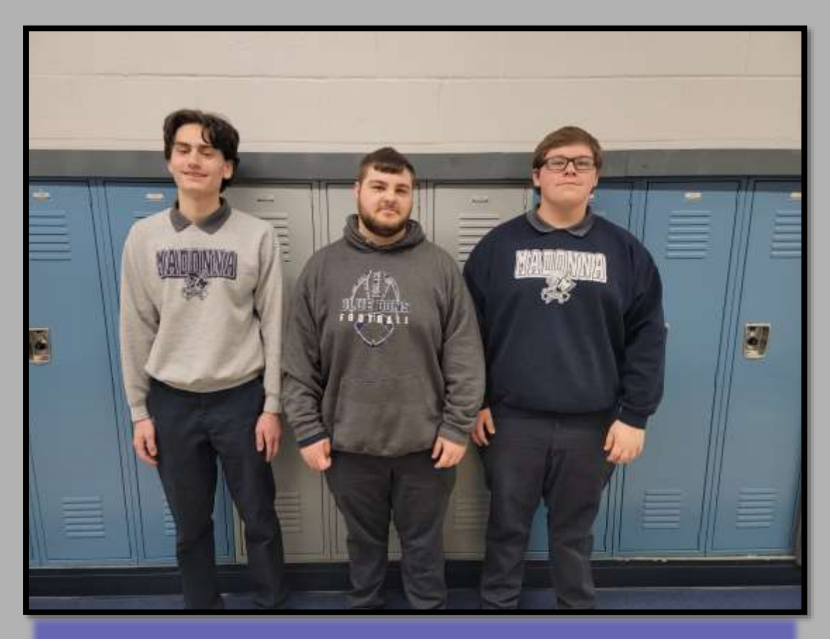
2021 Wrestling Team