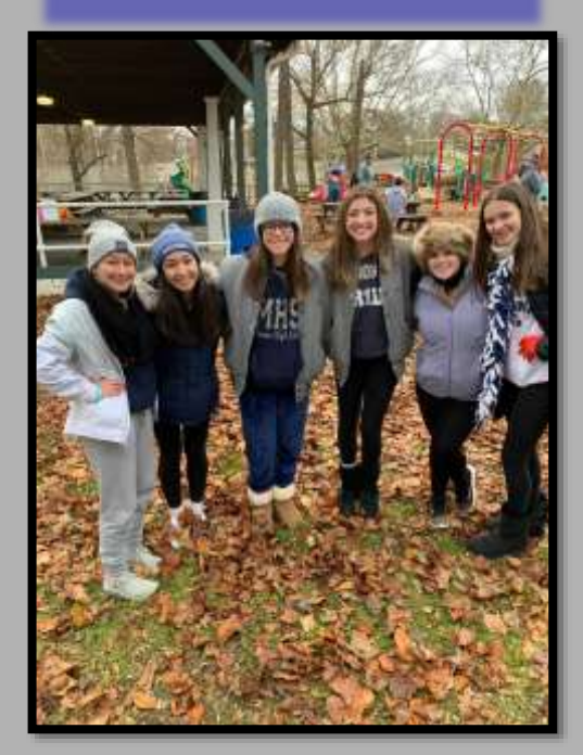
Students volunteered at the Weirton United Way's Turkey Trot.