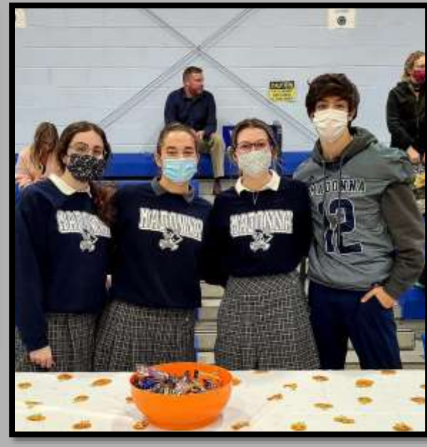
Students handed out candy at St. Joseph the Worker School's Halloween parade.