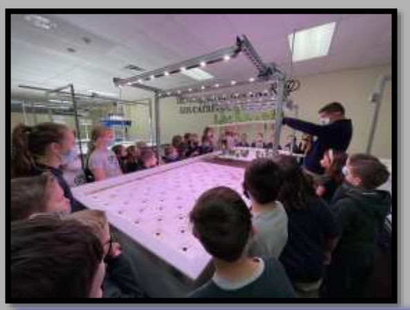
1st through 4th grades made a visit to Blue Stream Farms to learn more about aquaponics.