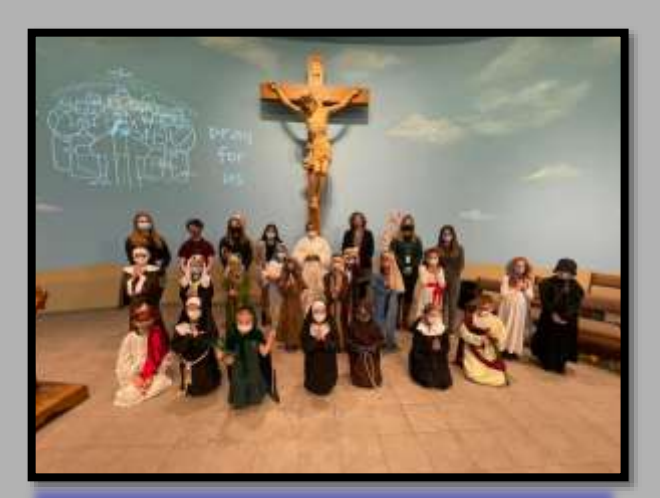
1st and 8th grade students led All-Saints Mass.