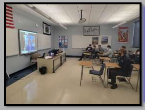
Senator Shelley Moore Capito spoke to the Honors Civics class via Zoom where she discussed the Constitution and different roles in the government.