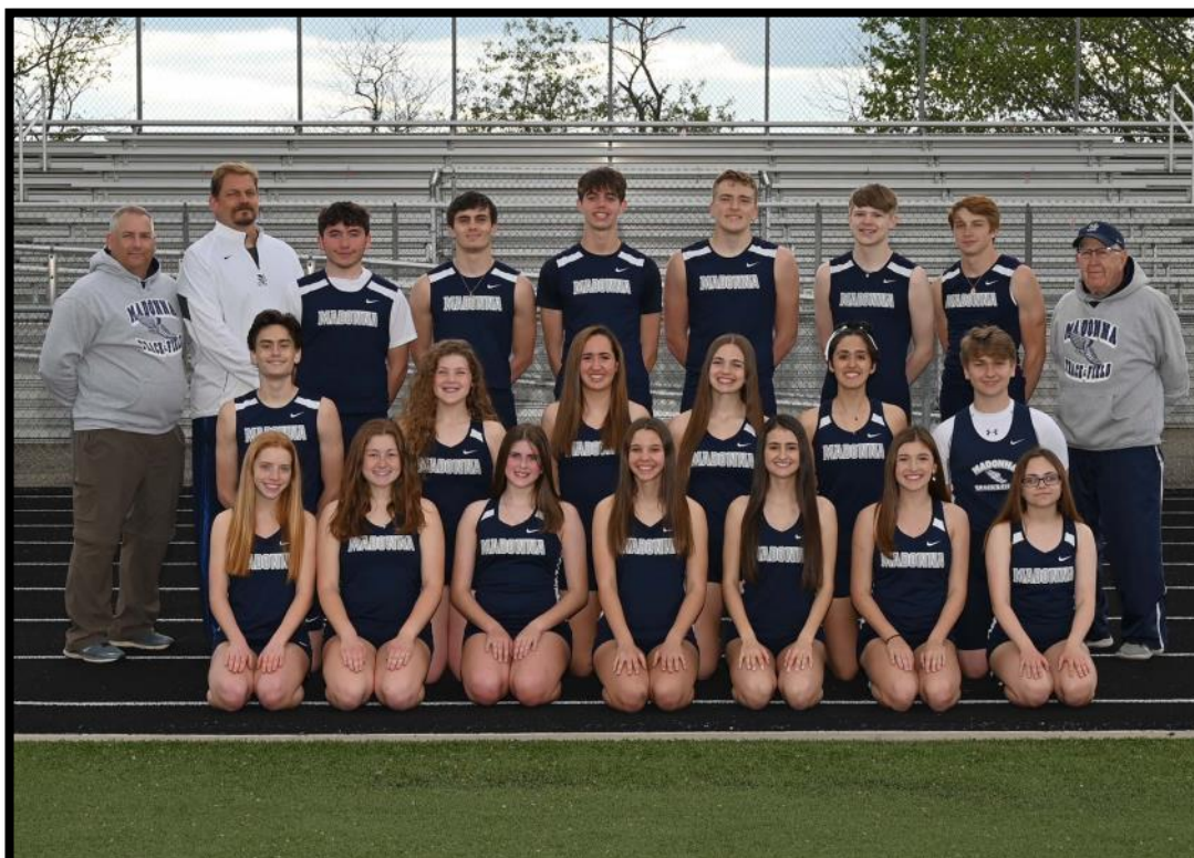
2021 Track & Field Team