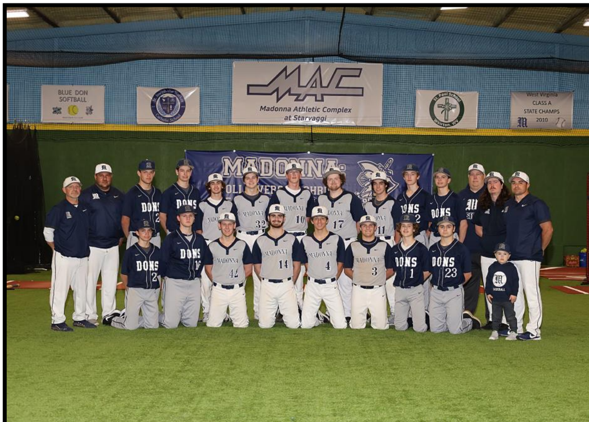
Top: 2021 Baseball Team