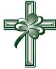
St. Paul School