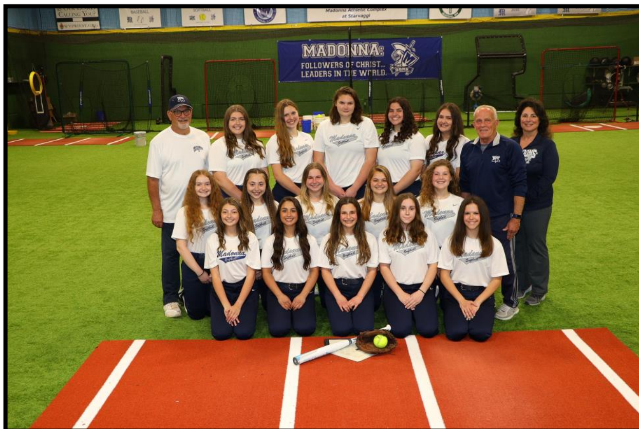
Top: 2021 Softball Team Bottom: Winning the Sectional Title