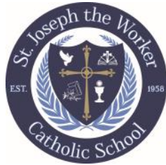
St. Joseph the Worker School