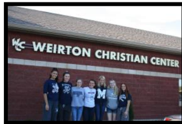
Senior Day of Service. Groups of students went to the Community Bread Basket, Weirton Christian Center, and the Table of Hope