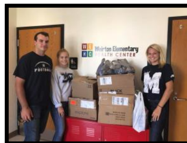
Interact Club's "Stuff a Bus" food drive for the Feed for Success Backpack program. Over 100 Macaroni & Cheese Cups were collected