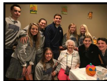
The Art Club enjoyed a visit with their friends at Wyngate Senior Living Community and decorated pumpkins for Halloween.