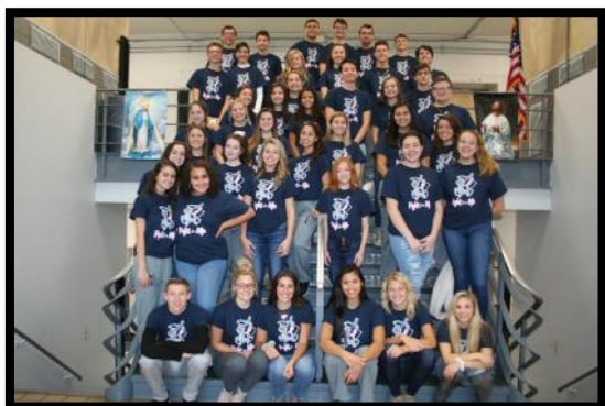
The Senior Class sold t-shirts to support Breast Cancer Awareness. A portion of the proceeds were donated to the Weirton Medical BreastCare Center.