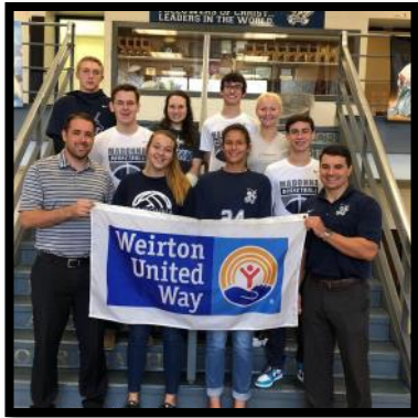
Madonna faculty, staff, and students supported the Weirton United Way by sponsoring a Fee Dress Denim Day.

The students and staff of Madonna High School have always been generous with their time and treasures and this year has been no exception. These photos are from Madonna giving back to our wonderful community this school year.