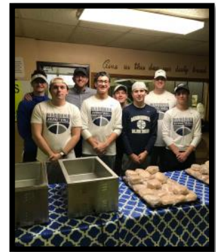
Boys Basketball Team volunteers at the Table of Hope