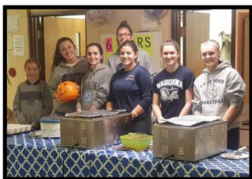
Lady Dons Basketball volunteered as a team serving those in need at the Table of Hope.