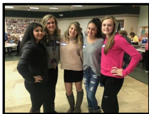
Members of Interact Club spent Thanksgiving Day serving food at the Weirton Senior Center. This is a yearly tradition for the club.