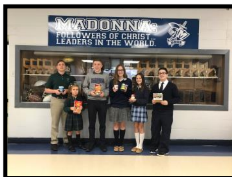
A joint effort canned food drive was held by all three Weirton Catholic Schools to help the Community Bread Basket