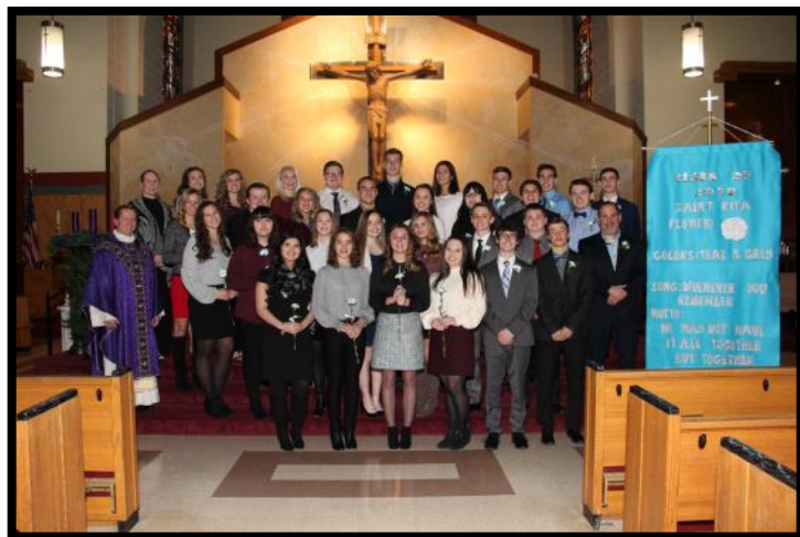
The Madonna Class of 2020 celebrated Junior Ring Ceremony.